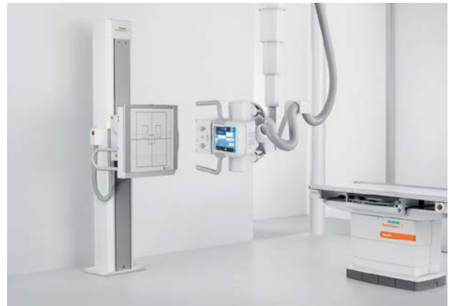
Ysio Max High-performance radiography