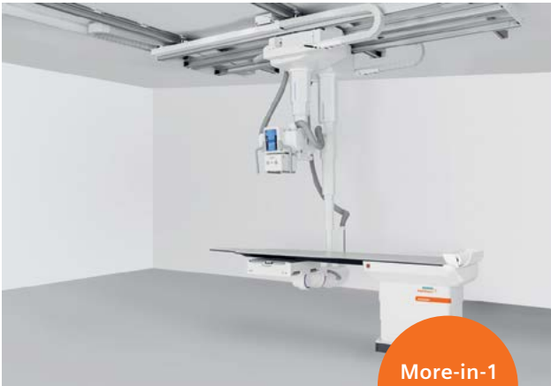
Multitom Rax Twin Robotic X-ray