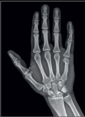
Hand, d.v. view 1 : Bone structures sharp and clearly visible

To make fast and confident diagnostic decisions, you need high and reproducible image quality. MOBILETT Elara Max offers high-end imaging, automated workflows, and advanced postprocessing technologies.