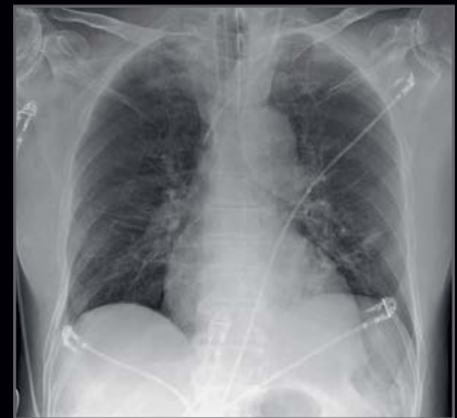
With DiamondView MAX