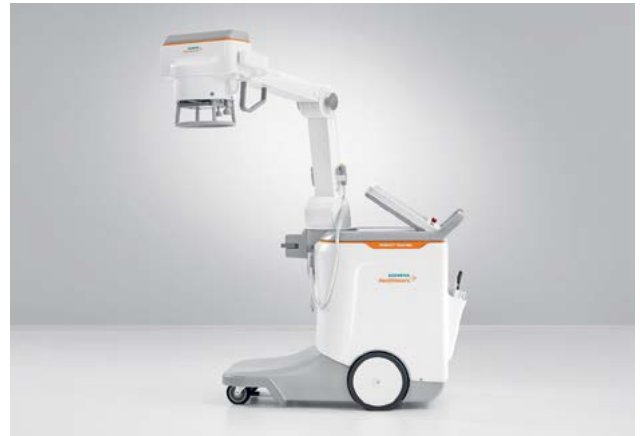
MOBILETT Elara Max High-end digital mobile X-ray imaging