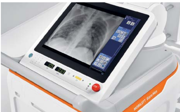
DiamondView MAX enables high image quality thanks to optimized noise suppression and enhanced contrast.

With its powerful 35 kW (450 mA) generator and wireless MAX detectors, MOBILETT Elara Max delivers excellent images fast. Gridless imaging in free examinations using DiamondView MAX postprocessing gives you the clear, detailed, high-contrast images you need for confident diagnostic decisions—at very low dose. At the same time, it reduces error rates and enhances your workflow efficiency.