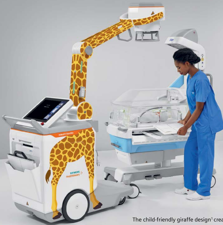
The child-friendly giraffe design 1 creates a relaxing environment.