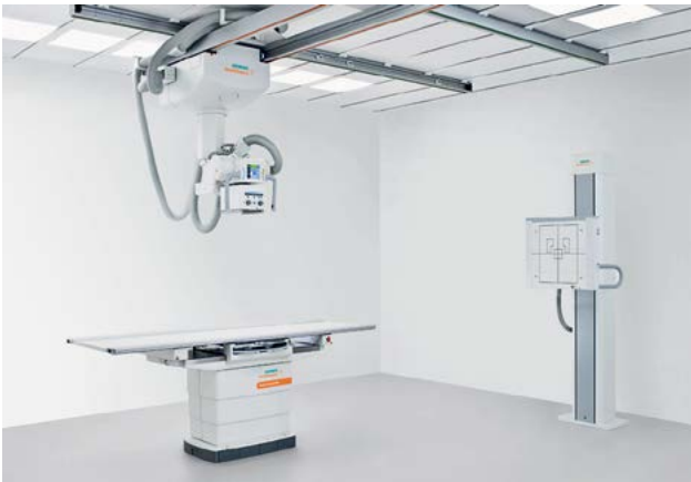
Multix Fusion Max High-efficiency radiography