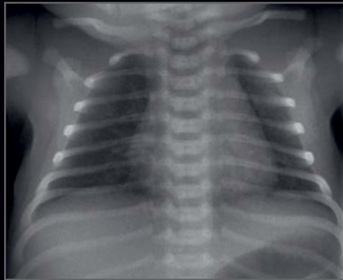
Pediatric chest, a.p. view 2 : Small structures outlined at low dose and reduced noise