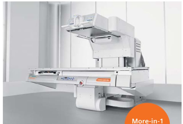
Luminos Agile Max 2-in-1 patient-side fluoroscopy