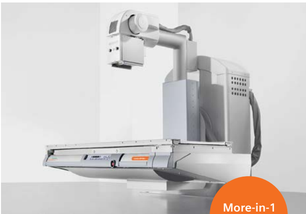
Luminos dRF Max 2-in-1 remote fluoroscopy