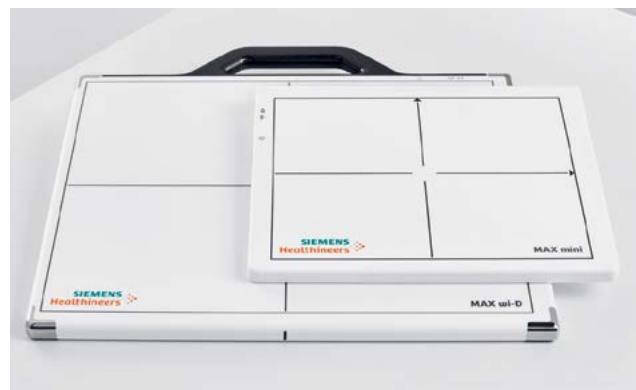
MAX wi-D detector: 35 cm x 43 cm, 3.3 kg MAX mini detector: 24 cm x 30 cm, 1.6 kg