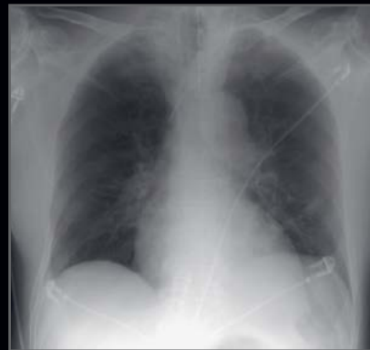
Without DiamondView MAX