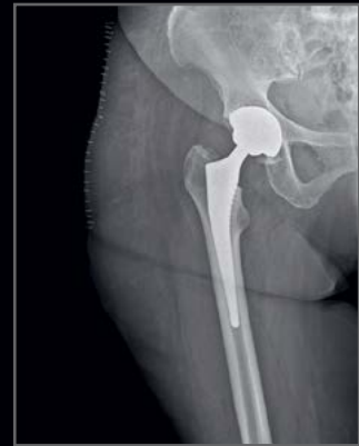
Postoperative hip joint with implant, a.p. view 1 : Diagnostically valuable results for dense organs