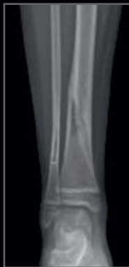
Without DiamondView MAX With DiamondView MAX